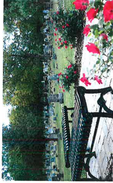
Benches are available throughout the cemetery to provide places to DownShift.

Maps are available with three different routes and distances that can be combined for the various capabilities and interests of our 'meditating movers'. The maps identify different points of interest along the routes with the different themes of nature, spiritual and history. The themes provide ideas for downshifting while strolling or relaxing along the way. An easy route without hills is also available for citizens that prefer a more leisurely walk.