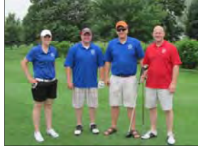
Best Dressed: Pritchard's of Mason City