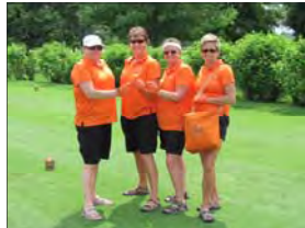
Best Dressed: Mason City All Risk Insurance