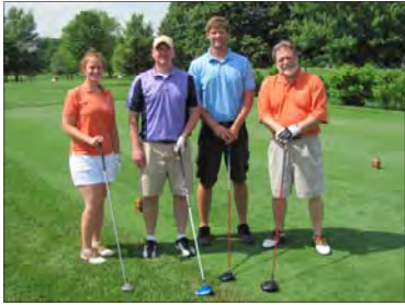
First Place: Cargill Kitchen Solutions