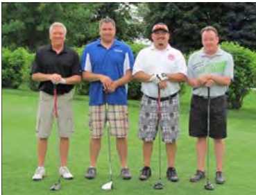
First Place: Graham Tire